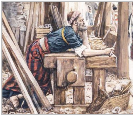
The Anxiety of Joseph by James Tissot