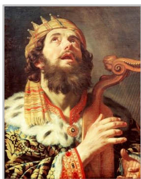
King David (Painted in 1622)

The title ‘ Son of David ’ is more than a statement of physical genealogy. It is also a Messianic title. When some people referred to Jesus as the ‘ Son of David ’, they meant that they believed He was the long-awaited Messiah – the fulfilment of the Old Testament prophecies. Jesus was addressed ‘ Son of David ’ by people who, by faith, were seeking mercy or healing. For example, the Canaanite woman from the Tyre and Sidon region whose daughter was being tormented by a demon Matthew 15:22 and the two blind men sitting by the Jericho road Matthew 20:30-31. The titles of honour they gave Him declared their faith in Him. Calling Him ‘Lord’ expressed their sense of His deity and power and calling Him the ‘ Son of David ’ expressed their faith that He was the Messiah.